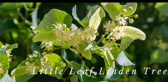
Little Leaf Linden Tree