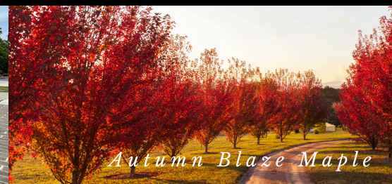
Autumn Blaze Maple