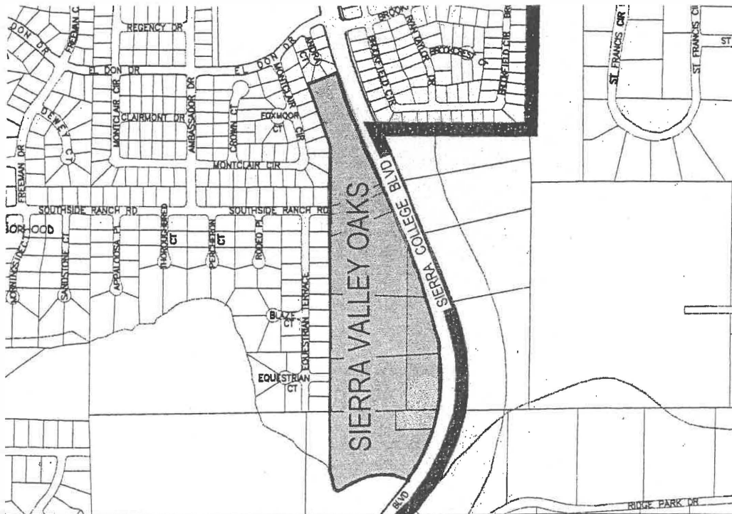
Map indicating the area included in the Sierra Valley Oaks General Development Plan, PDG-2001-06.