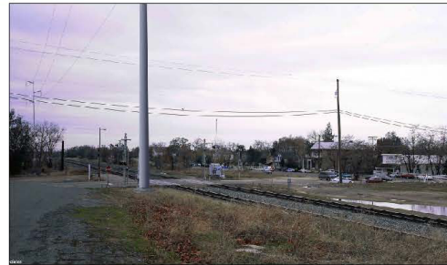
In their 2001 report, PG&E prepared simulations of how the powerline would look if installed. It would carry 65,000 kilovolts, but would be built to 115,000 kilovolt standards to allow for future expansion. Above is the view from Railroad Ave. which today includes the train depot, Old St. Mary's, and Heritage Park. The view below is Front Street, looking toward the firehouse and the community orchard.

It is hard to know what really swayed the CPUC to force PG&E to underground 1.2 miles of power lines from Sunset to Midas. PG&E cited the visual impacts in the revised plan, but rest assured, due to the combined efforts of the City of Rocklin, our Citizens group and other community organizations, the judge made it very clear that PG&E's original plans had to change. This ruling preserved downtown Rocklin's Historical District, and now look at what it has become. I smile every time I think of what the PG&E spokesman said in the caption to the Sacramento Bee article: "that the railroad tracks made the view nearly worthless". As it is said, just because you are big, does not mean you are right. We know better. Look what we have now.