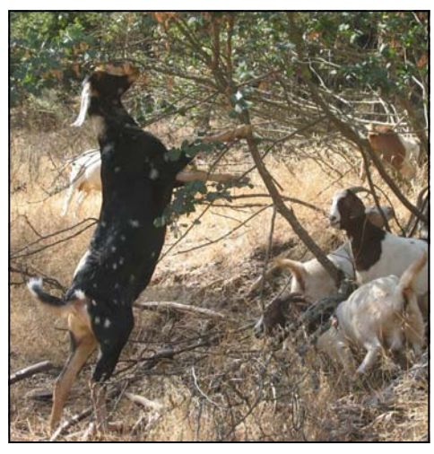
Goats are very athletic and are excellent climbers

Being such good climbers, goats prune lower tree branches, which helps to keep fire from spreading from the ground level into the tree canopy. Goats and sheep are often used together to graze areas that have a combination of grassland and woody vegetation.