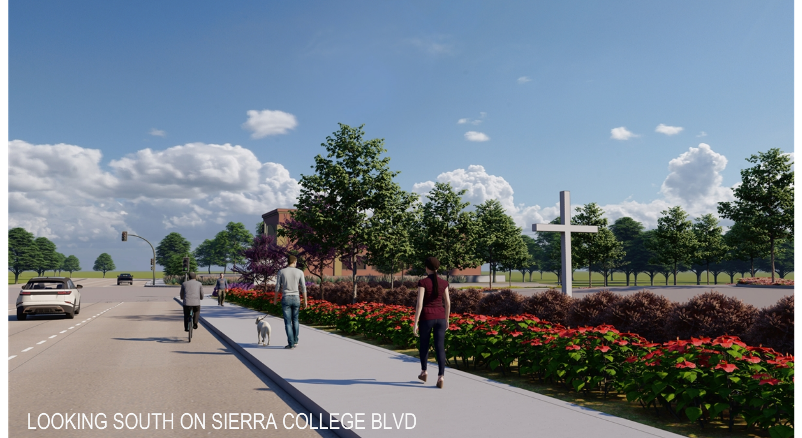
LOOKING SOUTH ON SIERRA COLLEGE BLVD