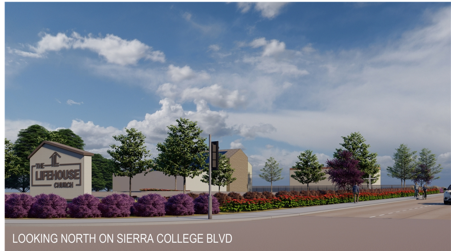
LOOKING NORTH ON SIERRA COLLEGE BLVD