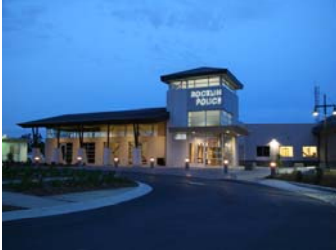
Rocklin Police Department Grand Opening June 8, 2005