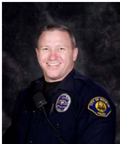
Officer of the Year