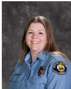
Dispatcher of the Year