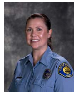
Professional Staff Person of the Year