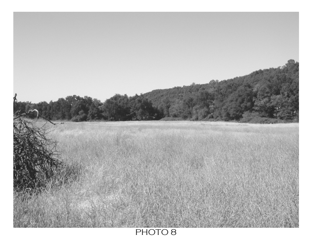
Chapter 4.3 – Aesthetics