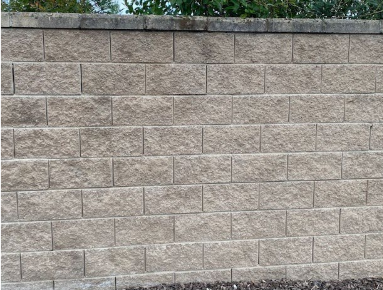
Example of a typical City of Rocklin Proto Wall and cap.