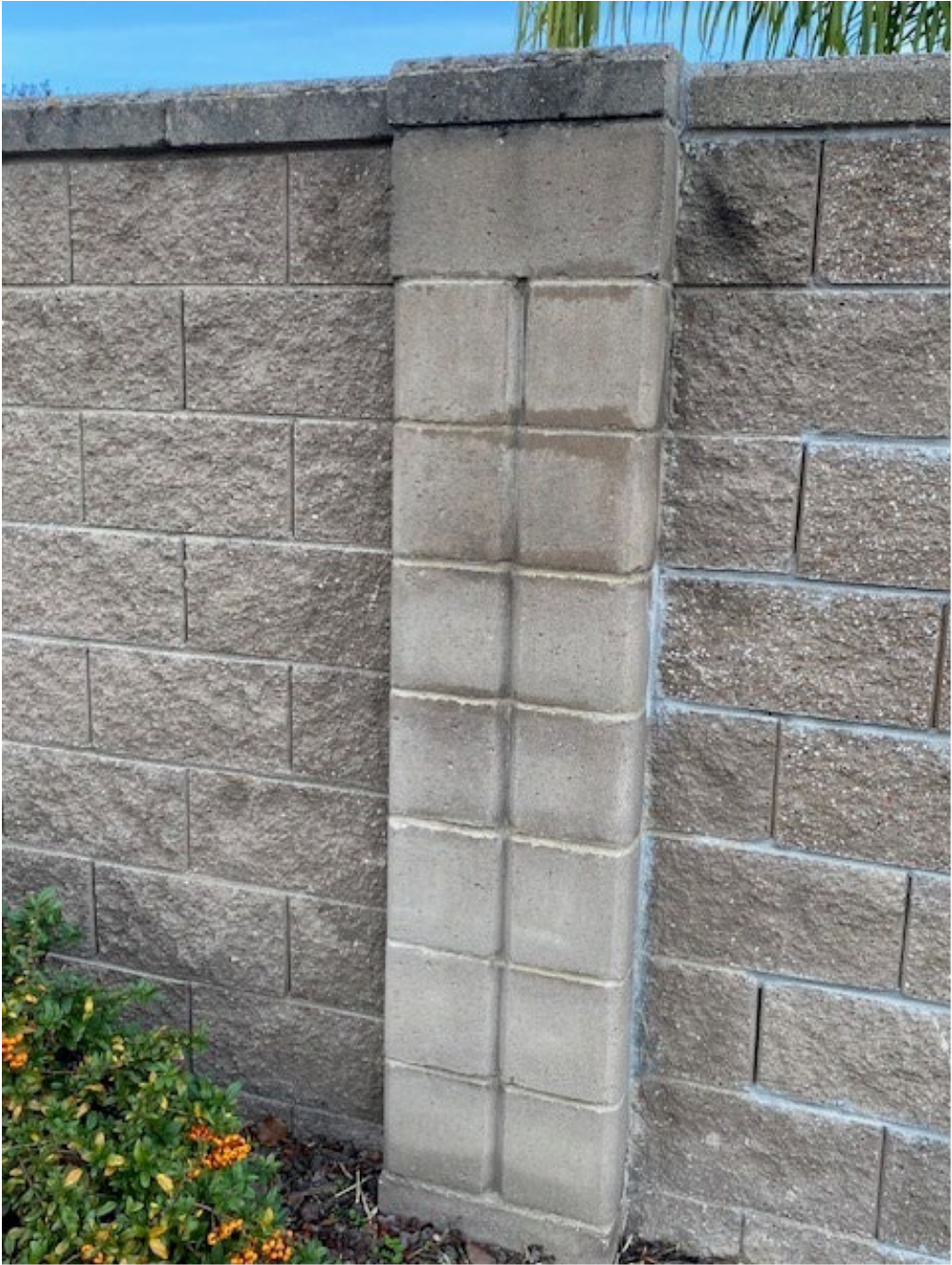
Example of a 6 foot wall column