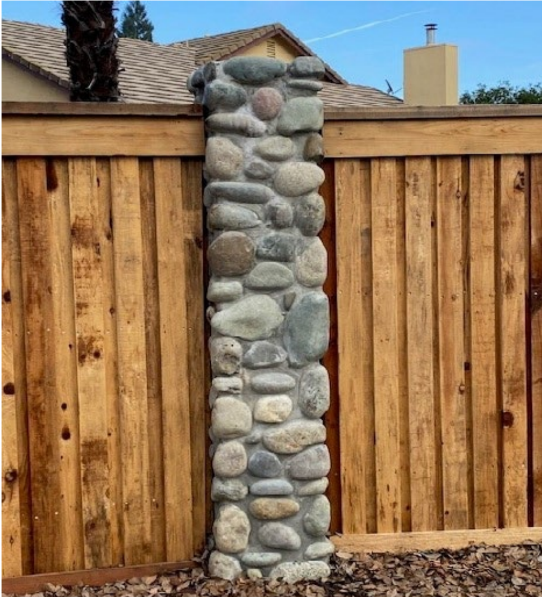
Example of 6 FT River Rock Column